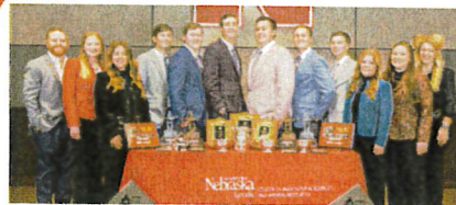
Members from the University Nebraska-Lincoln Livestock Judging Team