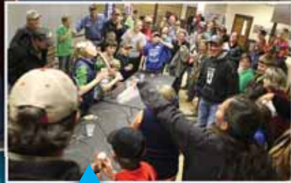
We work hard and play hard at Stock Show U ... World Championship Cupcake Eating Contest