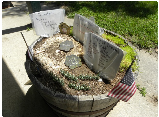
Field of Dreams Wildcat