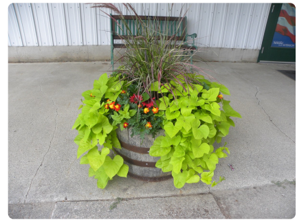
3rd Place Tie Wildcat 4-H Club