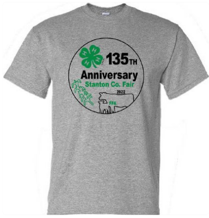
135 Anniversary Logo