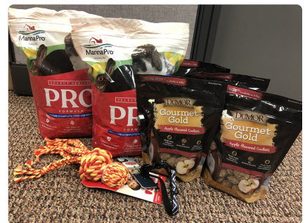
Rabbit, Horse, Dog Supplies