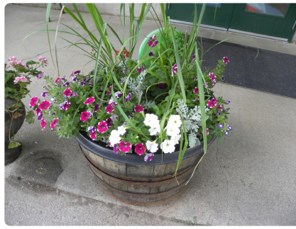
3rd Place Tie Bloomin' Blossom 4-H Club