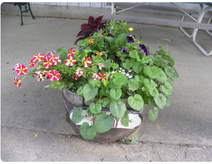
2nd Place Country Kids 4-H Club