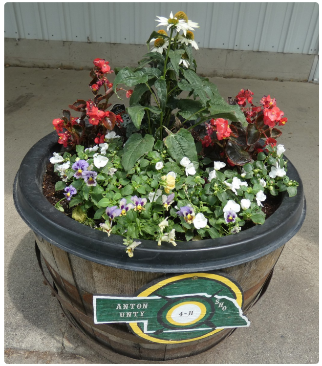
Stanton 4-H Shooters