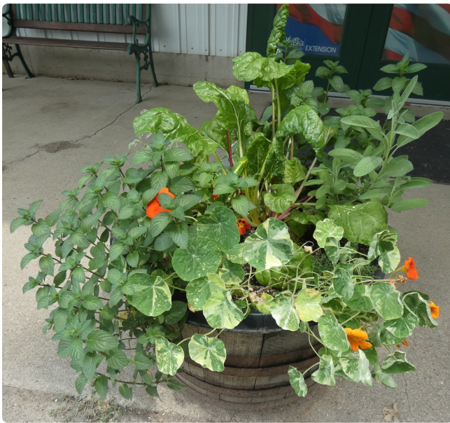
Bloomin' Blossom 2nd Place