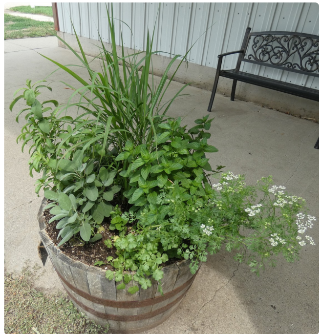
Wildcat 3rd Place

Thank-you to the Stanton View Garden Club for judging the barrels!