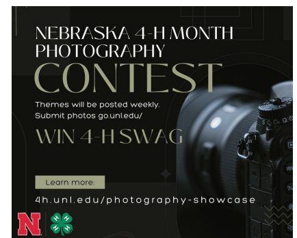
Photo entries will be weekly opportunities for 4-H members to showcase their photography skills based on different categories. Entries will be uploaded to the Nebraska 4-H Website link ( 4h.unl.edu/photography-showcase ) by midnight on Sundays starting on February 11th. Watch the Nebraska 4-H Facebook and Instagram pages for the weekly theme categories. Winners will be announced later in the week with their photo on social media. There will be 4-H Swag prizes given to all category winners.

Nebraska Extension is a Division of the Institute of Agriculture and Natural Resources at the University of Nebraska–Lincoln cooperating with the Counties and the United States Department of Agriculture. Nebraska Extension educational programs abide with the nondiscrimination policies of the University of Nebraska–Lincoln and the United States Department of Agriculture.