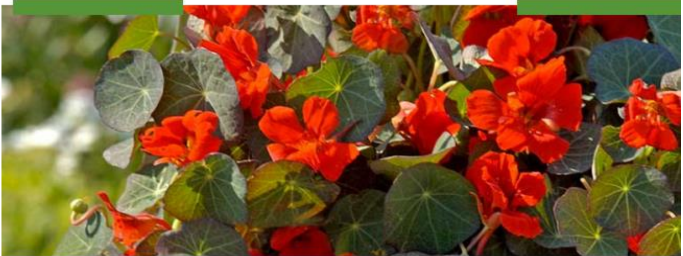
PRINCESS OF INDIA NASTURTIUM