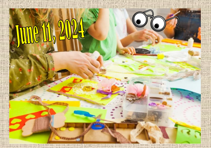
Registration thru Events in your 4honline.com account! See instructions on the front cover.

Clover Kids will make decorative tea light jars, a miniature fairy garden, a snack, and a unique canvas painting!