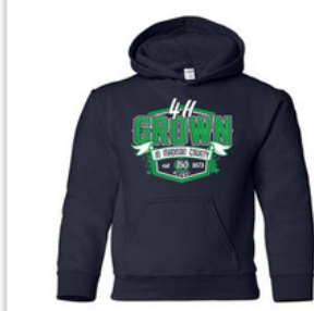
Alumni Youth Hooded Sweatshirt