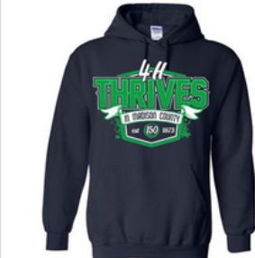
Member Adult Hooded Sweatshirt