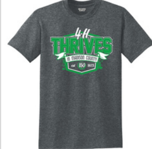
Member Adult Short Sleeve Tee