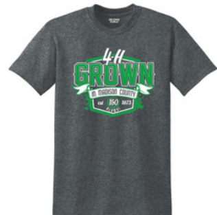
Alumni Adult Short Sleeve Tee