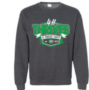
Member Adult Crewneck Sweatshirt