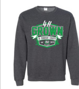
Alumni Adult Crewneck Sweatshirt