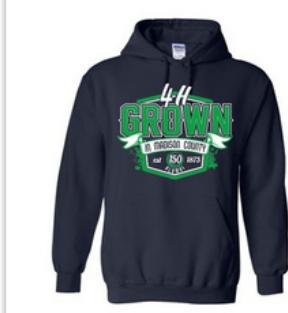
Alumni Adult Hooded Sweatshirt