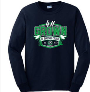
Alumni Adult Long Sleeve Tee