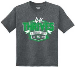
Member Youth Short Sleeve Tee

Online Store Deadline: Friday June 9th, 2023 (10:00am CDT)