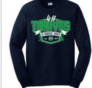
Member Adult Long Sleeve Tee