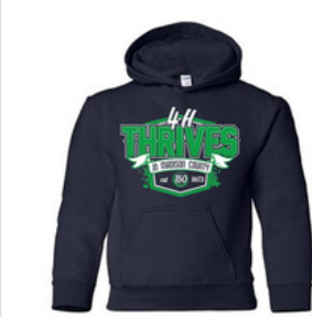
Member Youth Hooded Sweatshirt