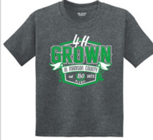
Alumni Youth Short Sleeve Tee