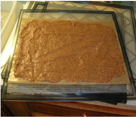
Figure 1. Spread fruit concentrate.

Canned fruits, such as applesauce, can be mixed with more expensive freshly cooked fruits to stretch the concentrate and soften the flavor. The addition of applesauce to juicy fruits also eases drying.