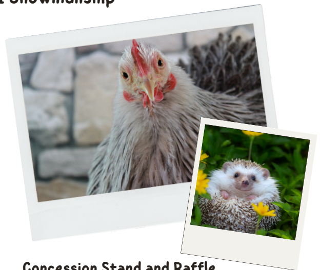
Concession Stand and Raffle by Lone Star 4-H Club