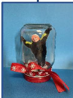
Photo Snow Globe

Get creative with trick photography by turning a person or object into the focal point of your snow globe. As a bonus project this year, we have included a baby food jar, binder clip, glitter, and fake snow.