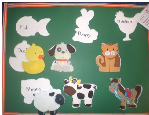
Matching game using animals to teach vocabulary words.