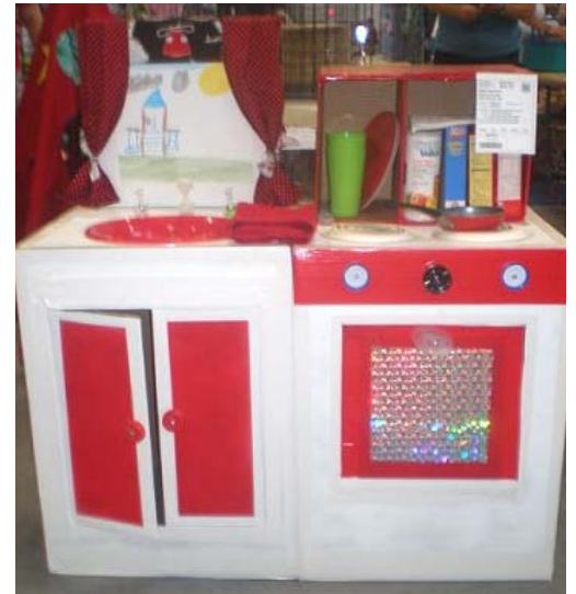
Role play experience for youth to prepare healthy foods and/or career exploration.