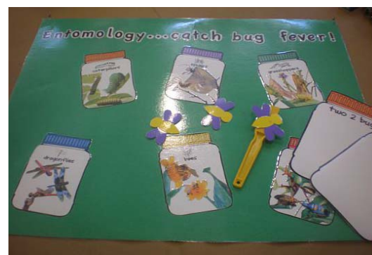
Science game based on insects.