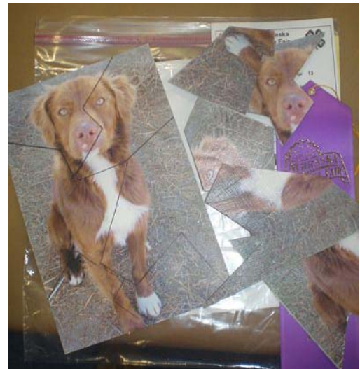
Right: Puzzles with picture of animals.