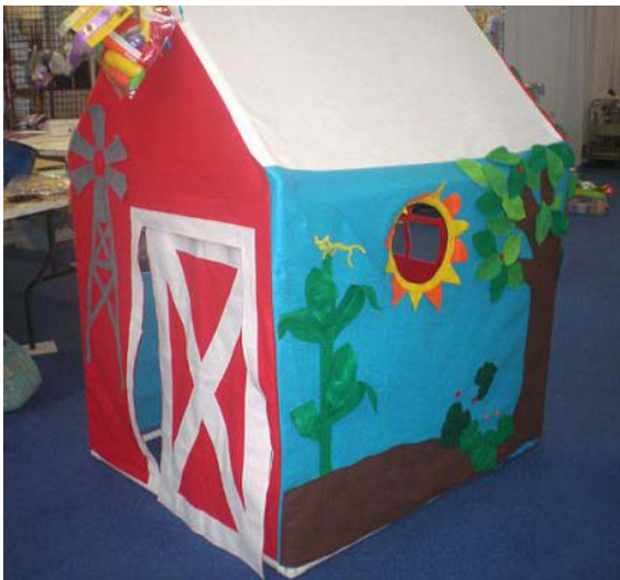
Left: Role play experience for preschoolers about agriculture.

In the past, many of the child development exhibits at fair have already been related to the outcome areas. Here are some ideas from the Nebraska State Fair 2011.