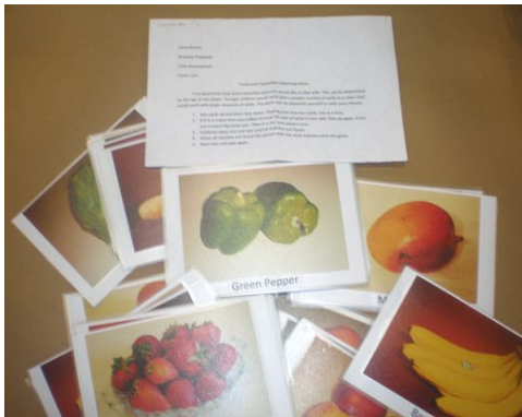
Nutrition game with fruits and vegetables.