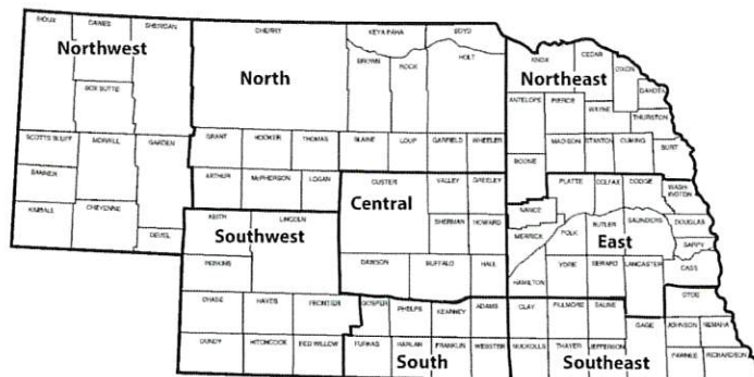
Figure 1. USDA Agricultural Statistics Services reporting districts for Nebraska

Seed, fertilizer, and chemical costs are not included in the custom rates unless specified per operation. The information presented in this publication should be used only as a guide when figuring what to charge or pay for custom operations.