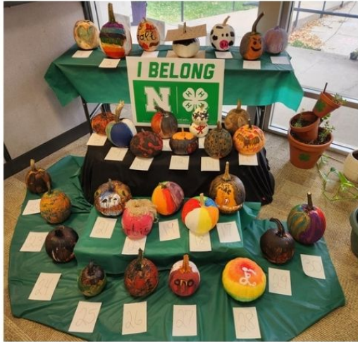
34 PUMPKINS DECORATED!