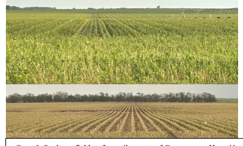
Corn & Soybean fields a few miles west of Geneva near Hwy 41

tornado warning in Fillmore County; after exiting the fairgrounds and returning to work with the fair board on what needed to occur, we were able to successfully have our Sunday beef show. I also connected a local news channel with a producer for a storm damage story and briefly assessed some of the hail damage in fields for our crop educators to assist producers. Clay County fair kicked off July 10<sup>th</sup> and wrapped with the livestock