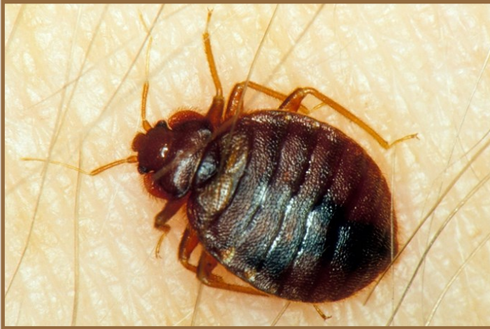
Adult bed bug

Bed bugs are blood feeding pests that can take up residence in our homes and can prove to be frustrating to deal with. Luckily, there are signs and symptoms we can be on the lookout for in our beds or even in hotel rooms to identify bed bug infestations. While bed bugs are small they are visible to the naked eye. Adults are near 1/4th inch in length and are comparable to the size of sesame or green pepper seeds. Bed bugs are an orange-red color. Immature bed bugs are between 1/25th of an inch and 1/5th of an inch.