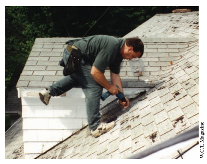
Figure 7. A professional placing a squirrel cage trap on a roof.

and May to reduce the risk of orphaning young. Translocation of squirrels is illegal in Nebraska. A problem squirrel must be released within 100 yards of capture site or euthanized. Euthanasia information may be found at icwdm.org .