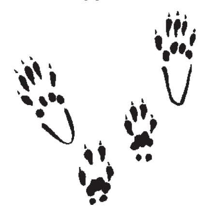
Figure 4. Tree squirrels typically hop, placing their hind feet forward of their front feet.

Squirrels can squeeze through holes 1.5 inches in diameter and will enlarge smaller holes by gnawing. Squirrels can climb vertical brick or masonry walls that have a roughened surface. They can enter through vents, chimneys, broken windows, knotholes, and gaps in construction under eaves or