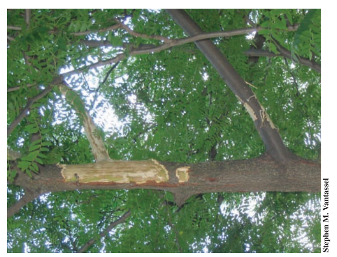
Figure 2. Tree bark is commonly stripped by squirrels during winter and spring.

mice. Visit icwdm.org to learn how to distinguish the signs of flying squirrels from mice. The remainder of this NebGuide will focus on managing problems caused by fox and gray squirrels.