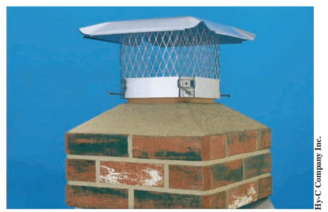
Figure 5. Stainless steel chimney excluder.

To reduce future problems with squirrels in buildings, prevent their access by inspecting and repairing small holes before they become large enough for squirrels to enter. Never secure an opening unless certain that it is no longer being used. Prevent air movement by filling gaps with caulk or expanding foam before covering openings with metal flashing, ¼-inch weave hail screen, or other permanent material. From the outside of the building, secure air-vents with ¼-inch hardware cloth. Paint the mesh to match the color of the vent to reduce its visibility. Secure roof vents with professionally manufactured stainless-steel screens. Consult with a roofer on proper installation techniques to prevent leaks. After ensuring that chimney flues are functioning properly, install a professionally manufactured stainless-steel chimney cap ( Figure 5 ).