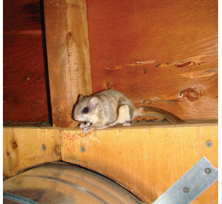
Figure 1. Eastern fox squirrel and southern flying squirrel.