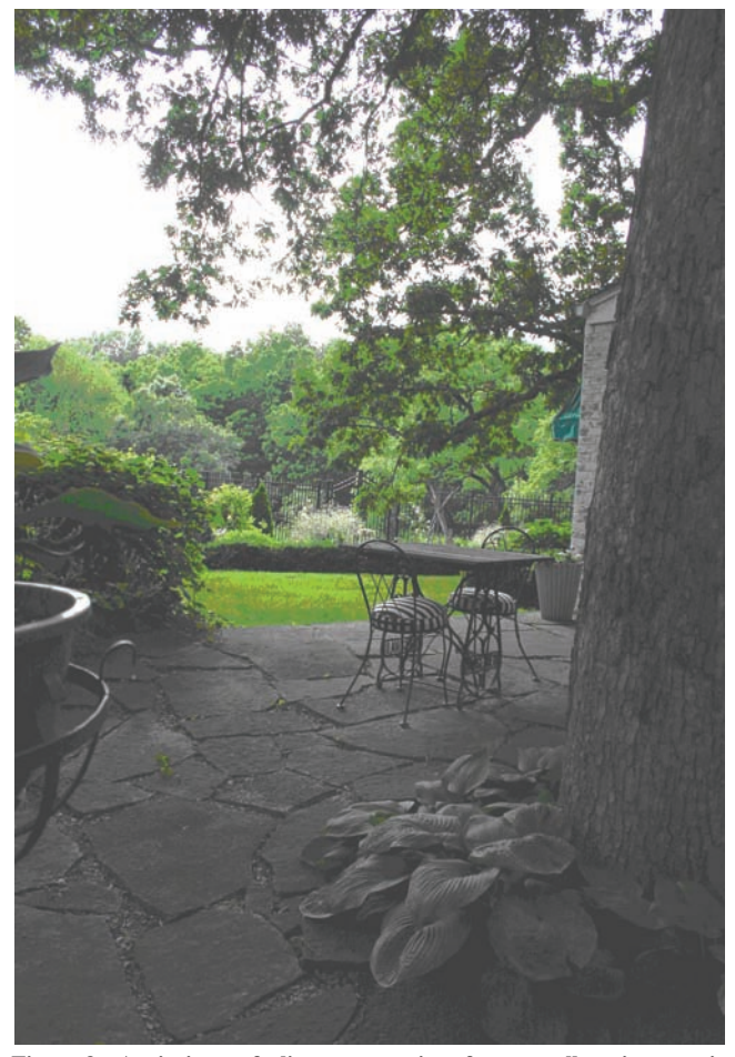
Figure 3. An intimate feeling, appropriate for a small patio area, is created by the "ceiling" of the low hanging branches.

and minimized snow drifting and other maintenance issues. Planting several trees of one species can be problematic when insects or diseases occur.