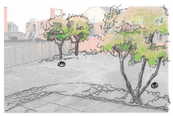
Figure 4. The left photo shows the potential lack of privacy due to neighbor views from windows and deck. The right photo shows two tree locations that will enhance privacy; a tree at location A will also strongly define space.