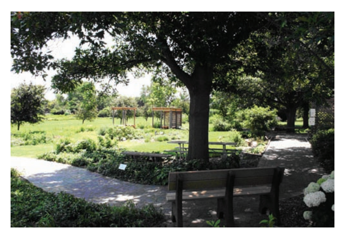
Figure 1. The dense shade produced by a red oak creates a comfortable seating area on a hot summer day.

Low sun angles during the winter will produce the largest shade patterns. As deciduous trees planted on the south and