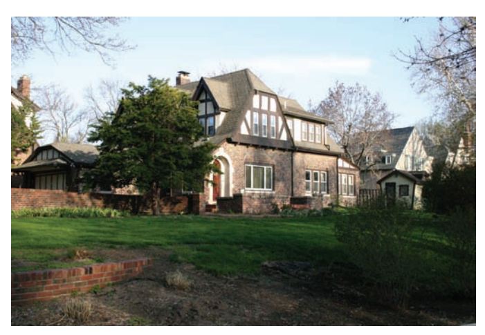
Figure 5. The trees in the left picture were planted too close to the house and are out of scale with the house; the evergreen tree on the corner of the house in the picture on the right is in proper scale.

"Walls" can be created by using small trees with upright form and relatively dense foliage or by creating an implied wall or edge with closely-spaced tree trunks or multiple-trunked trees. When using trees to screen views and enhance privacy, strategic locations should be selected to enhance screening value. Small trees placed closer to the living area will simultaneously define space and provide privacy while still allowing outward views ( Figure 4 ).