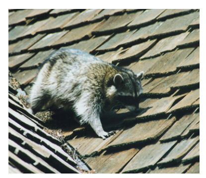
Figure 1. Raccoon on shingled roof.

his hands." Adult raccoons ( Procyon lotor ) typically are 26-40 inches long (nose to tip of tail). Their weight can vary dramatically as they fatten up in preparation for winter, but they usually weigh 7-35 pounds. On rare occasions, raccoons weigh up to 50 pounds. Raccoons breed in January through March. Mating behavior is quite active and includes much screeching and growling. Nine weeks later, females give birth to 2-5 young. Males do not assist in rearing young and may kill any young encountered. Females