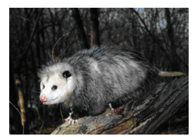
Figure 3. Opossum.

Opossums ( Didelphis virginiana ) have white to gray coloration in their fur, grow to the size of housecats and weigh around 10 pounds ( Figure 3 ). Their pointed face and rat-like tail lead many people to consider them to be oversized rats. Opos-