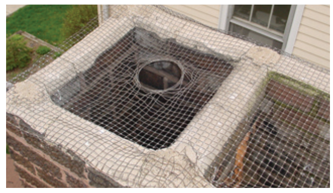
Figure 7. A raccoon made a home in this chimney after breaking through this "home-made" chimney screening. Non-professional screenings also may become packed with snow or ice thereby forcing toxic exhaust gases back into the home.

Secure crawl spaces below sheds, porches, and decks using 1 inch x 1/2-inch galvanized hardware cloth. Bury the mesh at least 4 inches below the soil and create a 12- to18-inch skirt under the soil to discourage digging. Some suggest digging down at 12-24 inches with a 12-inch perpendicular skirt. Consult Diggers Hotline of Nebraska, 800-331-5666, before initiating any digging. If aesthetics are a concern, consider painting the mesh with flat-black paint. Install lattice over it to reduce visibility.