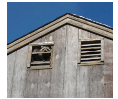
Figure 2. Raccoons can easily enter buildings through unsecured attic vents.

Raccoons do not construct their own dens but will use abandoned dens, hollow trees, crawl spaces, storm drains, attics, and chimneys ( Figure 2). Raccoons have been known to tear through