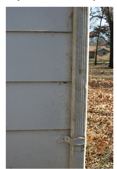
Figure 4. Brown smudge marks and fine scratches on a vertical surface are key signs of raccoon use.

under or through a fence, they usually will avoid digging extensively to gain access. If structures are involved, carefully check for openings. Opossums need an opening that is at least 3 inches wide, while raccoons need at least 4. Carefully investigate trees that could be used as "bridges" to the roof line. Look for scratches or brown smudge marks on the tree or building where the animal has climbed (Figure 4). Second, were footprints left behind? Both species have distinctive paw prints (Figures 5 and 6). Third, were any feces left behind?