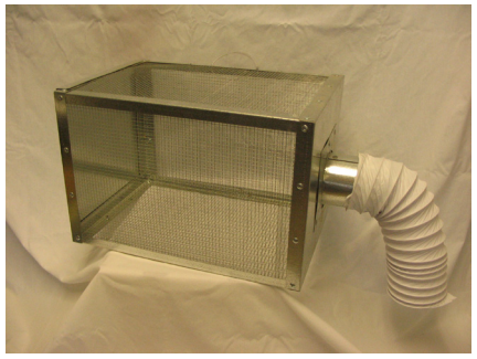
Figure 7. LaFrance's Bat Trap is an example of a commercial bat trap.

To prevent possible spread of the fungus that causes white-nose