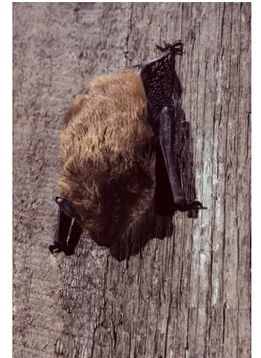
Figure 1. Big brown bat, Eptesicus fuscus.

Thirteen species of bats occur in Nebraska. Most, however, are uncommon and rarely found near structures. The big brown bat (Eptesicus fuscus, Figure 1) lives throughout the state and is the most