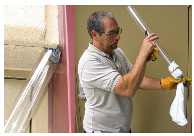
Figure 6. Left image shows how to place bat into the tube. Right image shows bat contained in the cloth funnel trap.

Cage traps consist of a tube, check valve, and holding chamber. Tubes are placed over the openings used by bats. Holding chambers are secured to the structure. After leaving the structure, the bats are captured by the trap, unable to return to the den site. The trap is covered and the collected bats can be