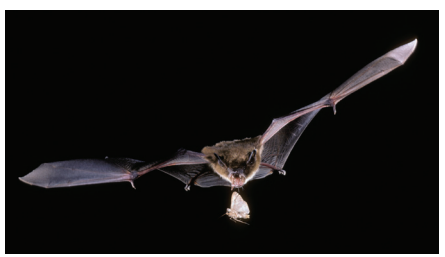
Figure 2. Big brown bat ( Eptesicus fuscus ) feeding on moth.

frequently encountered bat around structures. As the name suggests, this bat has dark brown fur on its back, pale brown fur on the underside, and black skin exposed on the nose, ears, and wings. It is 4 to 5