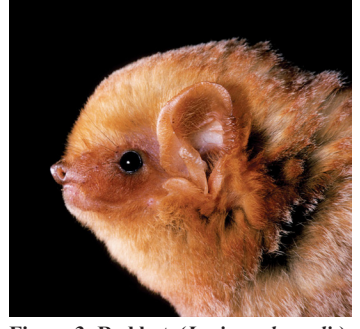
Figure 3. Red bat, ( Lasiurus borealis ).

The red bat (Lasiurus borealis, Figure 3) resides mainly in the bark or foliage of trees, including trees in residential landscapes. The red bat can be seen at dusk flying an elliptical pattern near trees while catching insects. Red bats have reddish-brown to rust-colored fur on top with a paler red underside and cream or off-white patches on each shoulder. Smaller