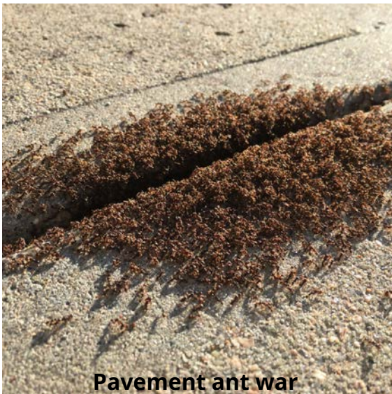
Pavement ant war

Workers : 2-nodes, 1/8" long, pair of spines on thorax, stinger, 3-segmented club on antenna, visible grooves/ridges on head and thorax, may be reddish-brown to black in color