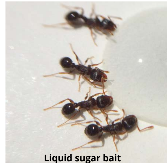
Liquid sugar bait