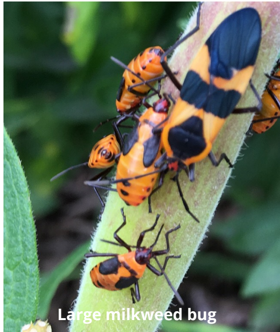
Large milkweed bug