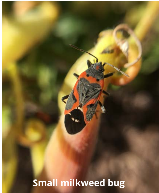
Small milkweed bug

False : 1/2" long, black double-heart and red "Y" on head