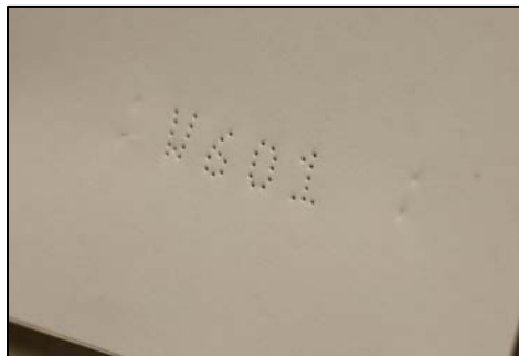
The digits in order on paper