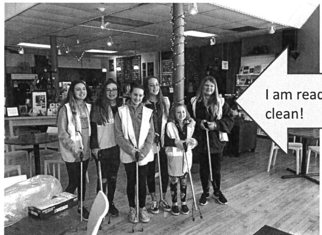
My 4-H club cleaning up the Old Market

Picking up trash may not seem like a fun way to spend Saturdays, but the members of 4-H club love getting together every other month for trash cleanup day in the Old Market. We have been doing this for the last year.