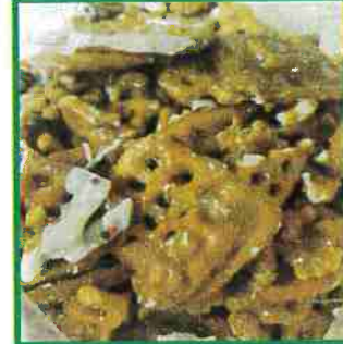
Caramel Drenched Pretzels