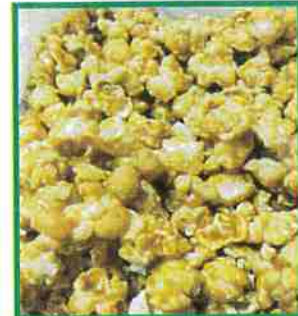
Popcorn Peanut Brittle