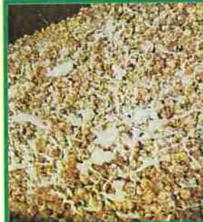
Raspberry Cream Cheese