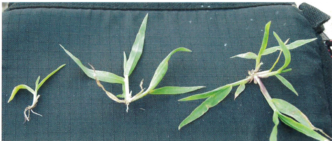
Figure 3. Crabgrass development stages from left to right: 3-leaf, 1-tiller, and 4-tiller. Smaller crabgrass is easiest to control with postemergence herbicides with the least risk to the desired turf.