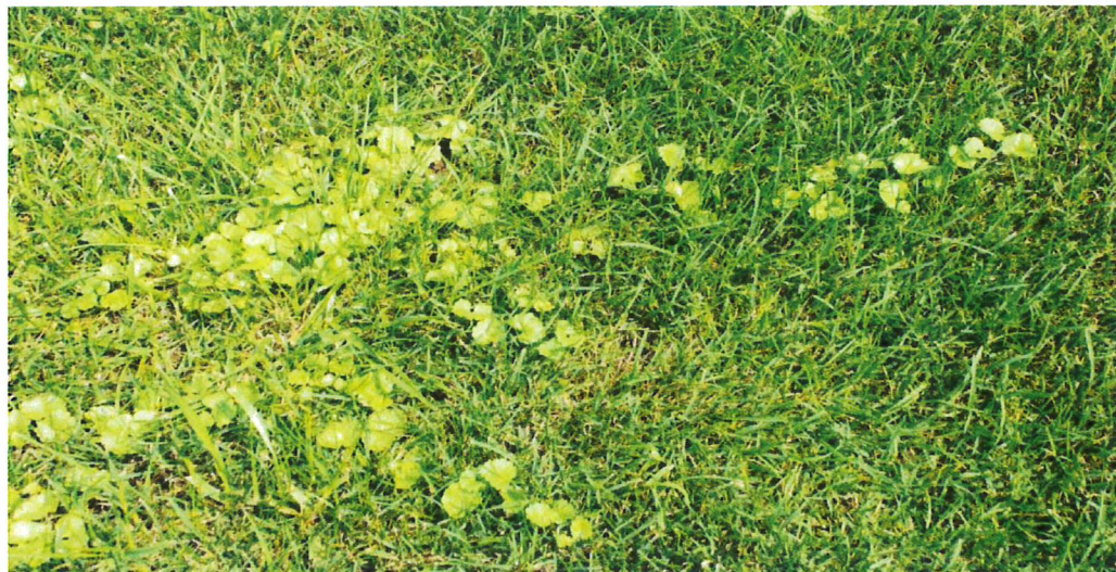
Figure 4. Hard-to-control weeds like ground ivy will spread by stolons or rhizomes out from the mother plant. Herbicides usually do not translocate effectively through stolons or rhizomes.