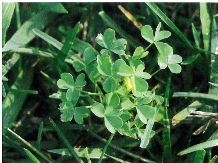
Figure 3. Summer annuals like oxalis (wood sorrel) are difficult to control because they will germinate for extended periods in the summer.