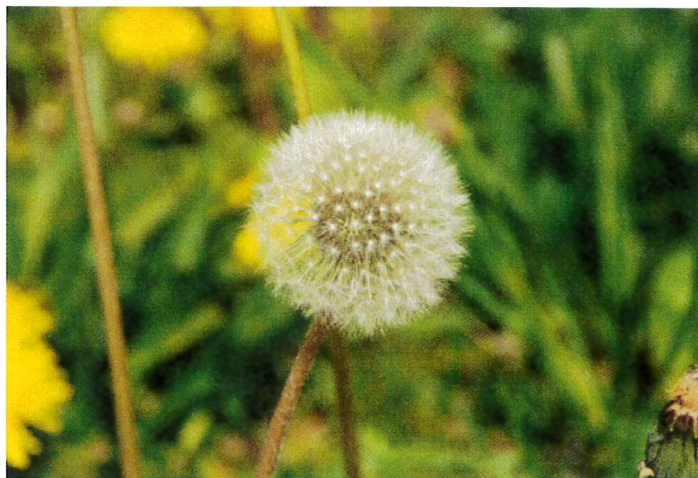
Figure 1. Weed seed can float on wind currents for miles.