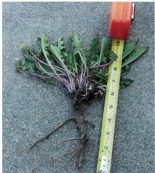
Figure 2. Many perennial weeds have extensive root systems like the tap root of dandelions. Herbicides will translocate throughout the weed better when applied in the fall than when applied in spring, thus resulting in better control in the fall.

Perennial broadleaf weeds continually grow from one year to the next. The aboveground vegetation may die back each winter, but the following spring new growth is produced from belowground roots or rhizomes. Perennials will also reproduce