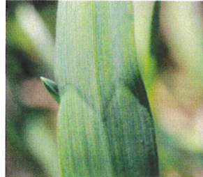
Smooth brome grass