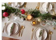
TABLE SETTING CONTEST WORKSHOP

July 2nd 10:00am-12:00pm Ages 5-18 FREE Location: Cass County Extension Meeting Room