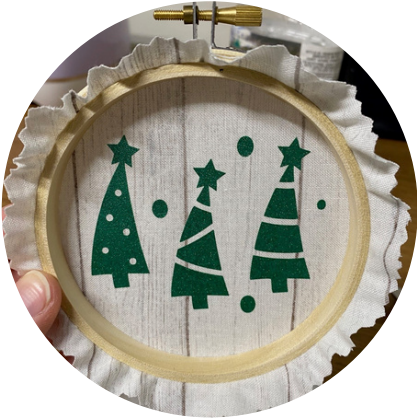
Embroidery Hoop Ornament

Join us Wednesday, December 28 from 9:00 - 11:00 am for some winter workshop fun! We will be making a total of three projects - two utilizing our Cricut! A small snack will be provided. Please bring your own drink if desired.