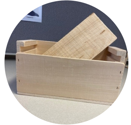
Decorated Trinket Box will start painted white

Register by Monday, December 19 . Workshop fee is $5 .