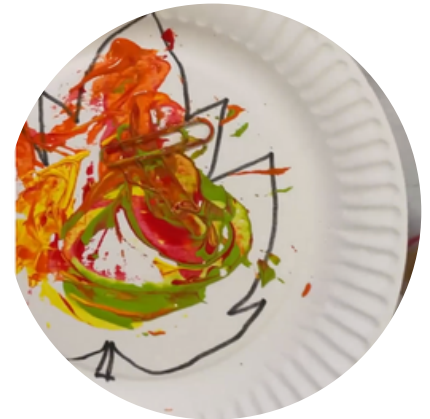
Painting with a Paper Clip and Magnet

Register by Monday, December 19 . Workshop fee is $5 .