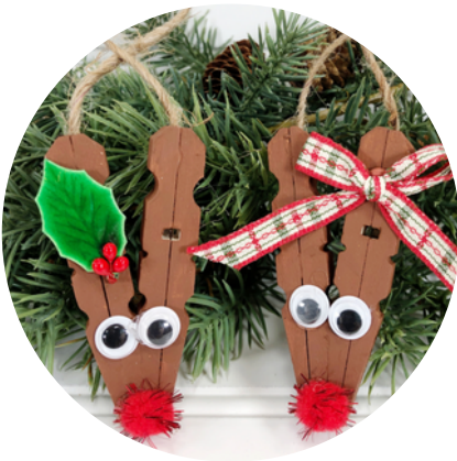
Clothespin Reindeer Ornament

Join us Wednesday, December 28 from 1:00 - 3:00 pm for some winter workshop fun! We will be making a total of three projects - please bring a paint shirt! A small snack will be provided. Please bring your own drink if desired.