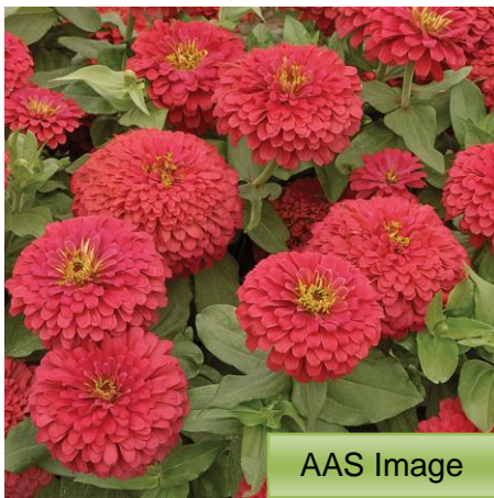
an annual bed.

The most common species of zinnia is Zinnia elegans . This species is an old garden favorite originally from Mexico and, thus, a warm climate plant. It features upright bushy plants with lance-shaped roughly textured leaves. Elegans range in height from six inches to as tall as three or more feet. Many flower forms exist including single, semi-double and double. Colors range from red, yellow, orange, pink, rose, lavender, green and white. One might say zinnias are available in just about every color except blue. This species of zinnia makes an excellent cut flower. This was the species that mother always grew, and one we often grow. Chris and Pat Dolan's yard in Minden showcases a beautiful Zinnia elegans garden.