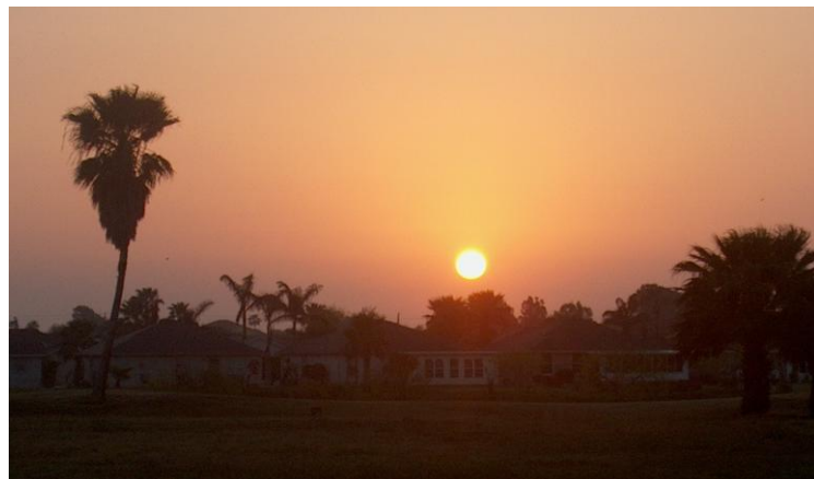
Sunrise on South Padre Island Golf Course

Certainly, according to the Christian faith, Jesus was the heroic king who proclaimed victory over death. With that, I wish each of you a Happy Easter.