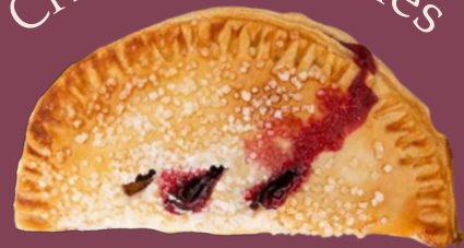
Cherry Hand Pies