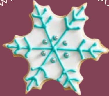
Snowflake Sugar Cookies