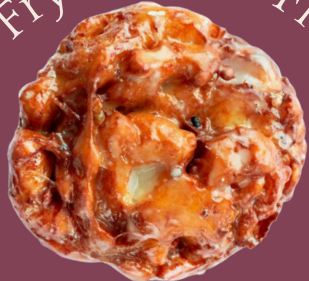
Air Fryer Apple Fritter