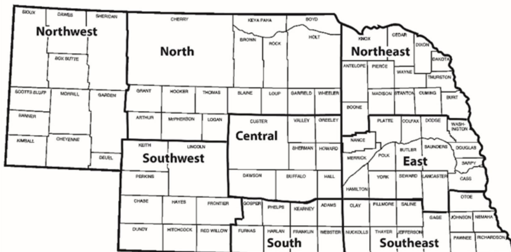
Figure 2. Nebraska Agricultural Statistics Districts

Rental rates for cropland and grazing land in 2019 reflected gradual declines across the majority of Nebraska (Table 2). Many challenges exist between landlords and tenants when negotiating equitable land rental rates in 2019. As reported, many absentee or retired landowners appear to have rising