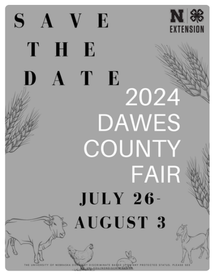
Save the Date Fair 2024