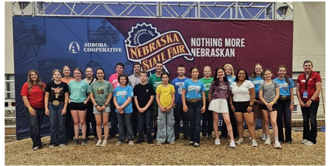
State Fair Exhibitors