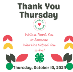
Thank You Thursday