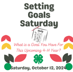
Setting Goals Saturday