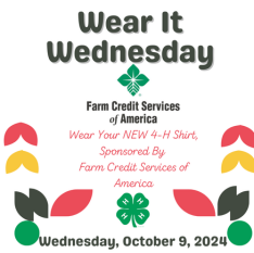
Wear It Wednesday