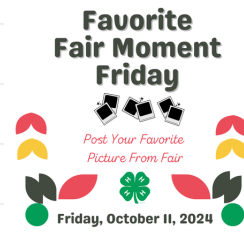
Favorite Fair Moment Friday