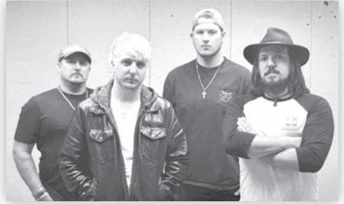
No Drinking on Grounds Friday, July 18 9:30 pm