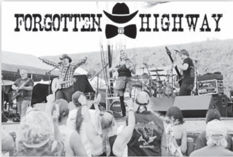
Forgotten Highway Saturday, July 19 7:30 pm