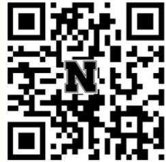
Go URL QR Code for 'panhandleservice'

Use the QR Code here to electronically record your hours spent doing community service this month. Let's see if Cherry County can take home the prize! And to keep your children motivated, print off this tracking sheet and put it up on your refrigerator. For every 60 minutes of service completed, color in a 4-H clover.