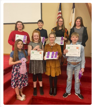
Music and Talent Participants