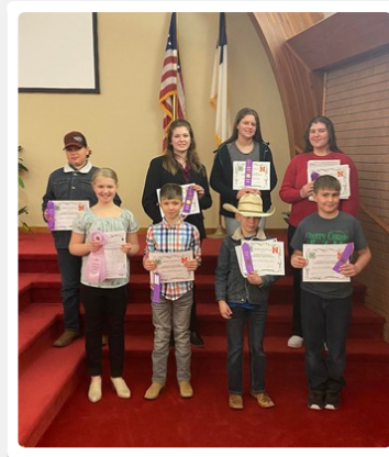
Public Speaking & Presentation Participants