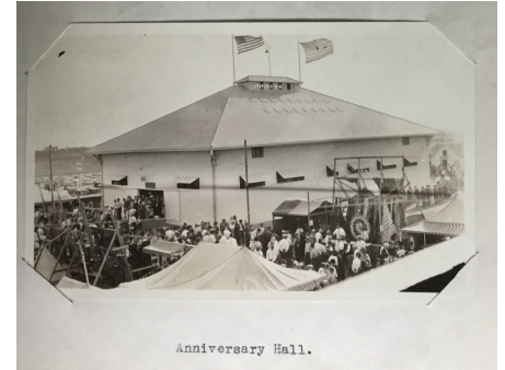
Anniversary Hall - 1925

Did you know that 2025 will be the 150th year of the Fillmore County Fair? The Fillmore County fair looked much different back then. For example, 4-H wasn't established till 1902, so the exhibits were much different! Throughout the next year, we are going to explore some of the popular exhibits that were displayed throughout the years! Each month will have a different theme and will either have a workshop, appointment time, or take home kit.