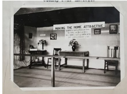
Home Beautification Fair Exhibit- 1920