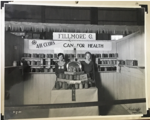
Fillmore County Fair Exhibit 1930