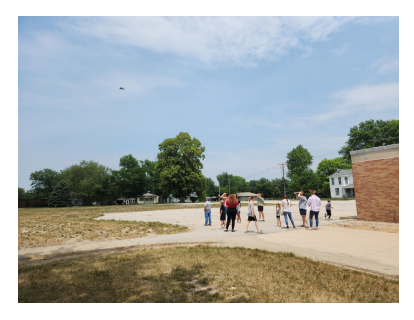
June 8: Agronomy

Drones and agriculture technology were the focus of this workshop. Participants learned how a drone works and were able to see pictures and videos from the drone.