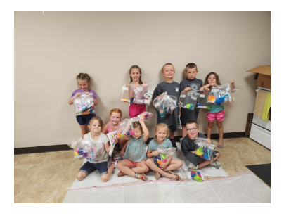
June 20: Clover Kid Tie Dye

They started by painting pots to create a home, mixed soil, then chose the perfect plants for their pots.