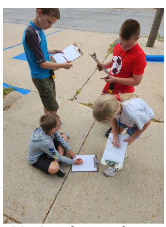
June 29: Outdoor Adventures

Thanks to local carpenters, participants were able to learn more about woodworking by making their own flower boxes.