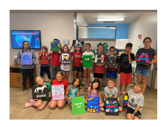
June 22: Visual Arts

Drones and agriculture technology were the focus of this workshop. Participants learned how a drone works and were able to see pictures and videos from the drone.