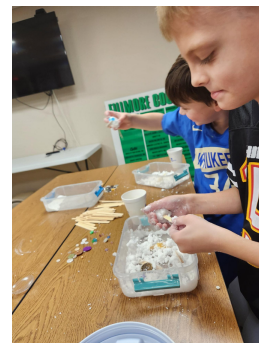
FC K-2 After School, Fizzing Snowmen