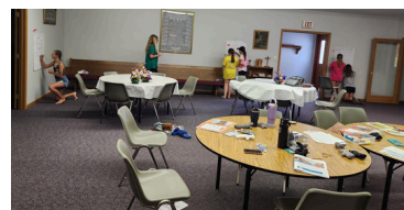
Thinking through different safety scenarios