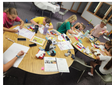
Working on the babysitting flyers