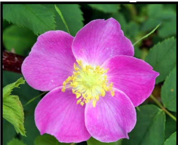
The Sitka Rose

salmon in that area survive, and how the wholesale removal of trees has had a very negative impact on recent salmon harvests.