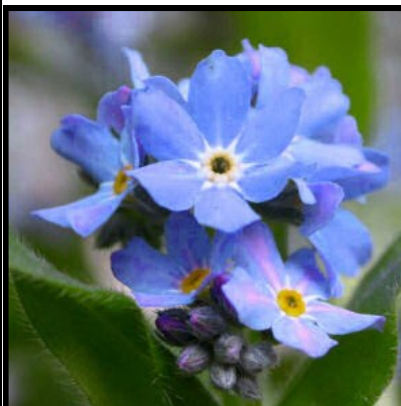
Alaska's State Flower, the wild forget-me-not, Myosotis alpestris