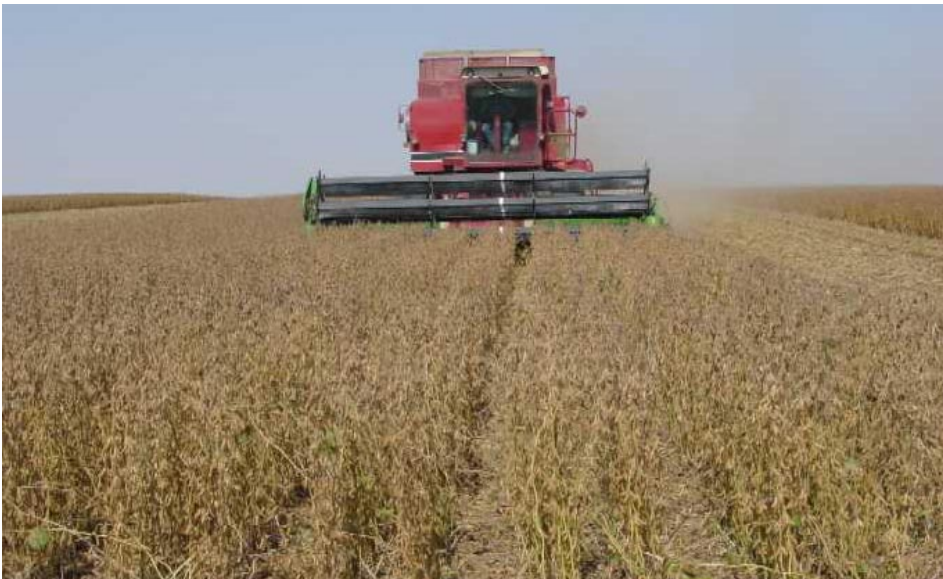
Tracking harvest yields from this narrow-row York County soybean field was part of NU Cooperative Extension's on-farm research in fall 2001. About 20 producers in York, Hamilton, Clay and Fillmore counties annually team with extension to conduct the research.